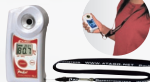
▲ PAL Silicone Cover