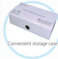
Convenient storage case