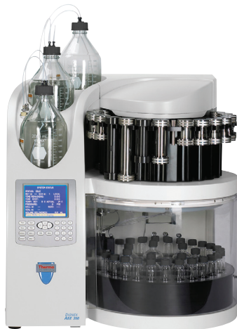
Dionex ASE 350 Accelerated Solvent Extractor system

Baking chocolate and milk chocolate bars were purchased from a local grocery store.