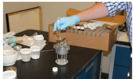
Figure 3. Extracts are loaded into the Dionex ASE Puck.