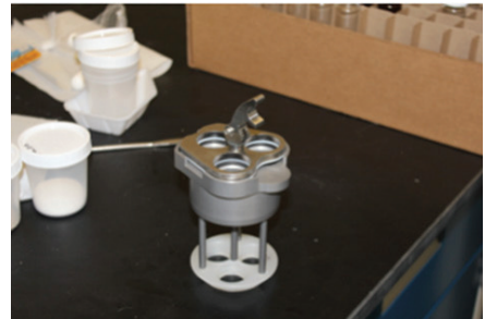
Figure 2. Dionex ASE Puck for three 60 mL collection vials.