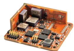
MTi OEM: 37x33x12 mm, 11g, 16-pins header