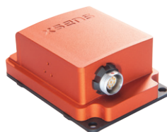
MTi enclosed: 57x42x23.5 mm, 52g, 9-pins push-pull connector