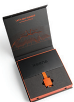
MTi 100-series Development Kit: MTi, software and cabling